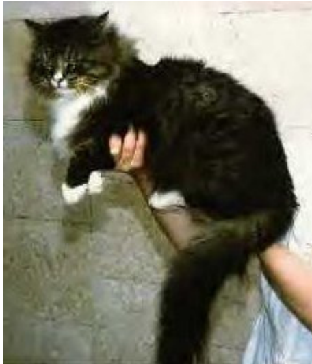
Fig 4, IC Mars